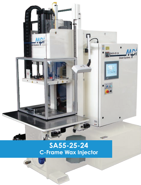
SA55-25-24 C-Frame Wax Injector

MPI is at the forefront of automation, having automated some of the most complex processes in the investment casting industry for well over a decade. MPI's automated injection and assembly cells provide the capability to make and assemble wax patterns from the simplest commercial parts to complex patterns required by the medical and aerospace turbine blades. MPI can automate a single process or implement full-scale automation for your facility.