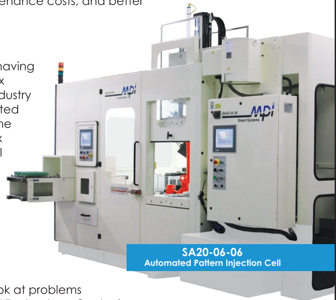
SA20-06-06 Automated Pattern Injection Cell