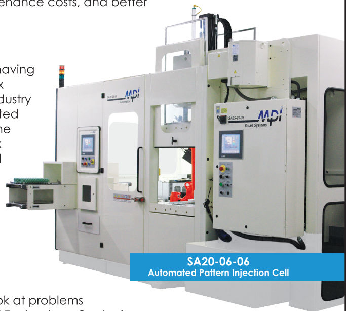
SA20-06-06 Automated Pattern Injection Cell