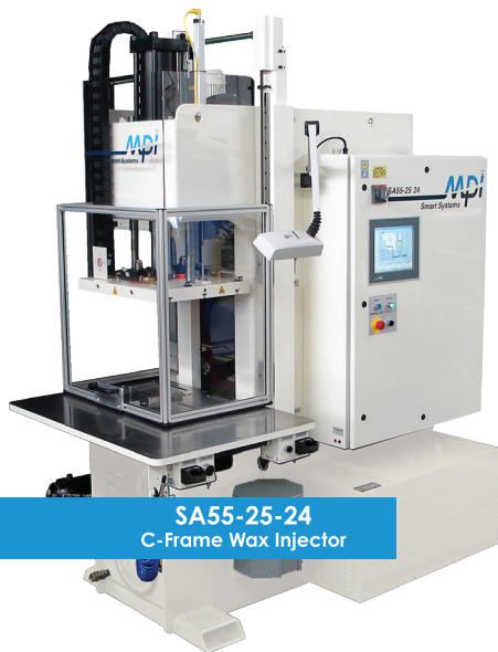
SA55-25-24 C-Frame Wax Injector

MPI is at the forefront of automation, having automated some of the most complex processes in the investment casting industry for well over a decade. MPI's automated injection and assembly cells provide the capability to make and assemble wax patterns from the simplest commercial parts to complex patterns required by the medical and aerospace industries, including single crystal turbine blades. MPI can automate a single process or implement full-scale automation for your facility.