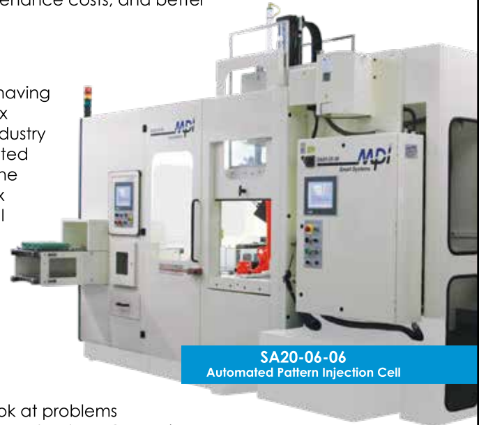
SA20-06-06 Automated Pattern Injection Cell