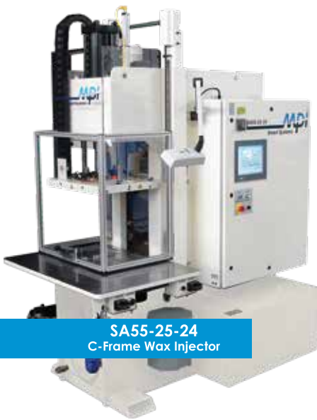
SA55-25-24 C-Frame Wax Injector

MPI is at the forefront of automation, having automated some of the most complex processes in the investment casting industry for well over a decade. MPI's automated injection and assembly cells provide the capability to make and assemble wax patterns from the simplest commercial parts to complex patterns required by the medical and aerospace industries, including single crystal turbine blades. MPI can automate a single process or implement full-scale automation for your facility.