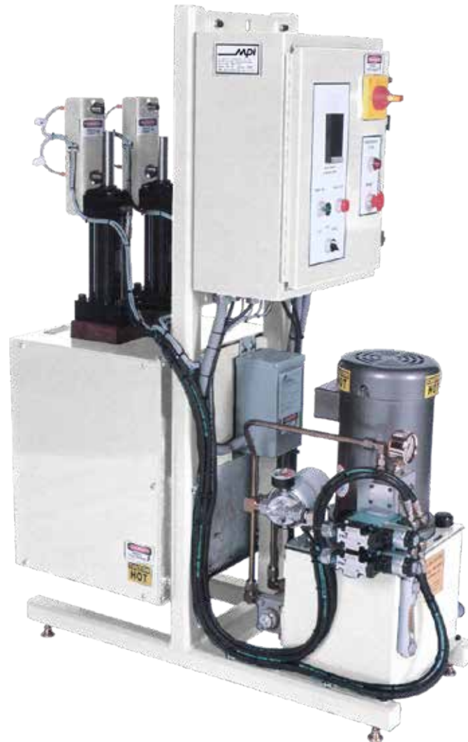
MODEL 96 HYDRAULICALLY DRIVEN WAX PUMP SHOWN