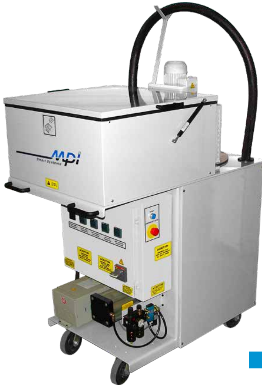
MODEL 95-25 Portable Unit Shown