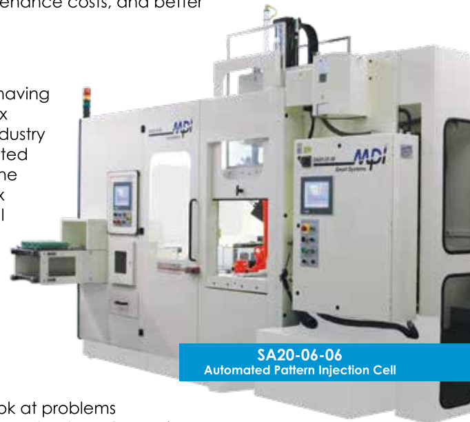
SA20-06-06 Automated Pattern Injection Cell