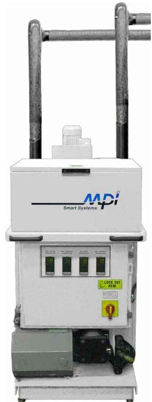
MODEL 95-25 Stationary Unit Shown

ELIMINATE THE LEADING CAUSE OF PROBLEMS IN THE WAX ROOM, UNEVEN WAX TEMPERATURE!