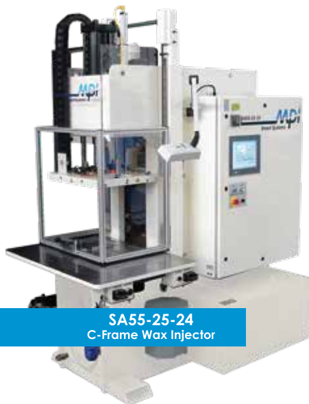
SA55-25-24 C-Frame Wax Injector

MPI is at the forefront of automation, having automated some of the most complex processes in the investment casting industry for well over a decade. MPI's automated injection and assembly cells provide the capability to make and assemble wax patterns from the simplest commercial parts to complex patterns required by the medical and aerospace industries, including single crystal turbine blades. MPI can automate a single process or implement full-scale automation for your facility.