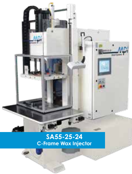
SA55-25-24 C-Frame Wax Injector

MPI is at the forefront of automation, having automated some of the most complex processes in the investment casting industry for well over a decade. MPI's automated injection and assembly cells provide the capability to make and assemble wax patterns from the simplest commercial parts to complex patterns required by the medical and aerospace industries, including single crystal turbine blades. MPI can automate a single process or implement full-scale automation for your facility.