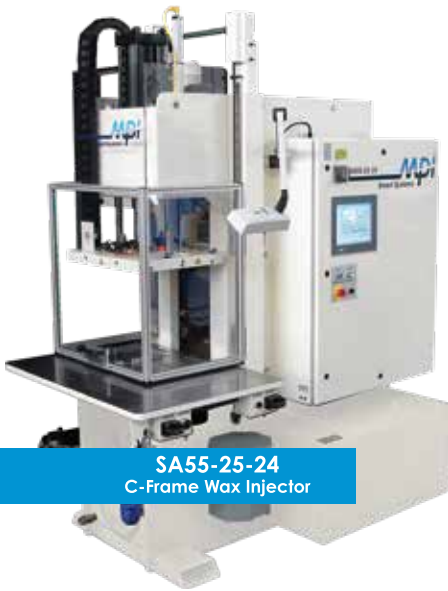
SA55-25-24 C-Frame Wax Injector

MPI is at the forefront of automation, having automated some of the most complex processes in the investment casting industry for well over a decade. MPI's automated injection and assembly cells provide the capability to make and assemble wax patterns from the simplest commercial parts to complex patterns required by the medical and aerospace industries, including single crystal turbine blades. MPI can automate a single process or implement full-scale automation for your facility.