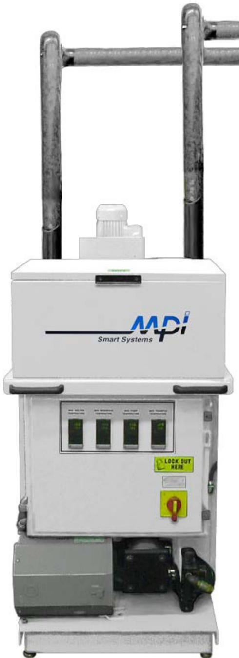
MODEL 95-25 Stationary Unit Shown

ELIMINATE THE LEADING CAUSE OF PROBLEMS IN THE WAX ROOM, UNEVEN WAX TEMPERATURE!