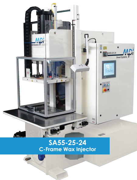
SA55-25-24 C-Frame Wax Injector

MPI is at the forefront of automation, having automated some of the most complex processes in the investment casting industry for well over a decade. MPI's automated injection and assembly cells provide the capability to make and assemble wax patterns from the simplest commercial parts to complex patterns required by the medical and aerospace industries, including single crystal turbine blades. MPI can automate a single process or implement full-scale automation for your facility.