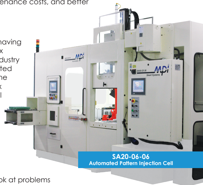
SA20-06-06 Automated Pattern Injection Cell