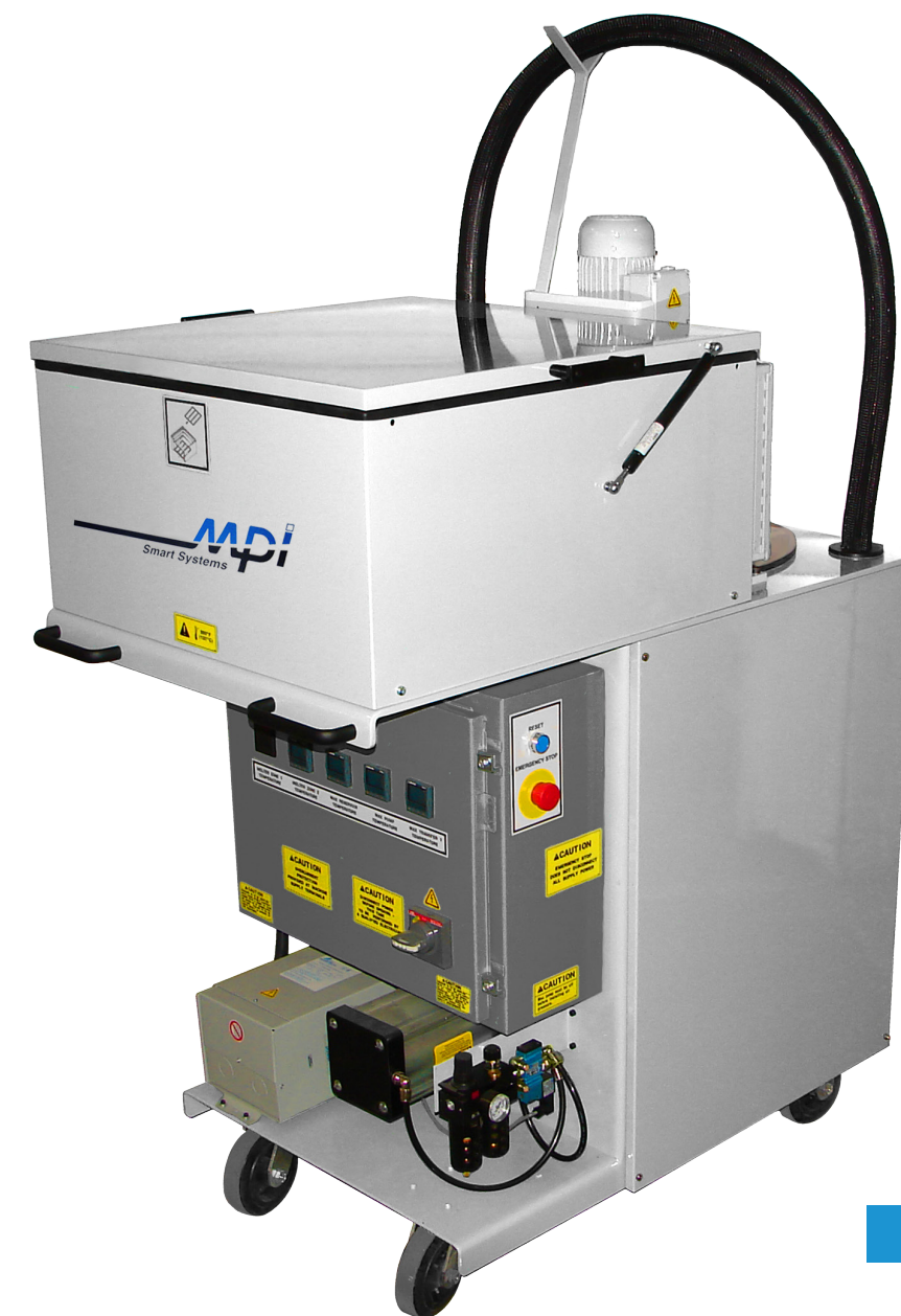
MODEL 95-25 Portable Unit Shown