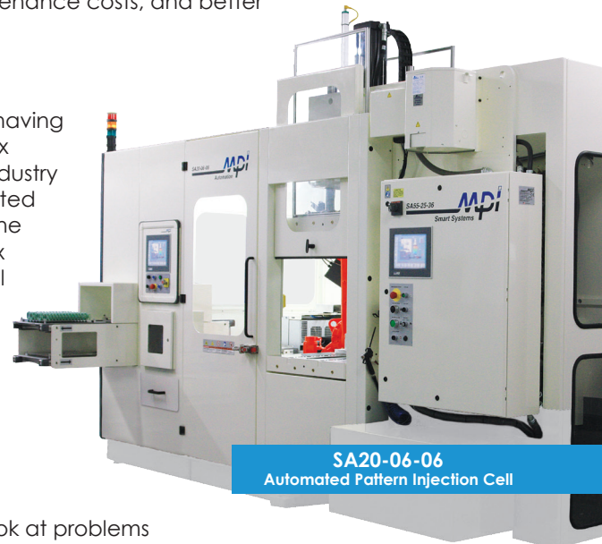
SA20-06-06 Automated Pattern Injection Cell